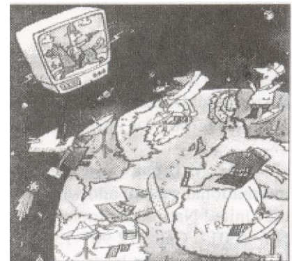
All the world's a dish

28. Exploring Africa is a web based resource for teaching and learning about Africa developed by the African Studies Center of the Michigan State University. The current phase is focused on middle school students. http://exploringafrica.matrix.msu.edu